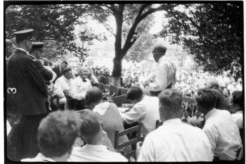
Clarence Darrow cross-examines William Jennings Bryant in Dayton, Tennessee during the 1925 "Scopes Monkey Trial" that tested a law that prohibited teaching evolution.

Assaults on teaching evolution are still taking place over 80 years after the Scopes trial!