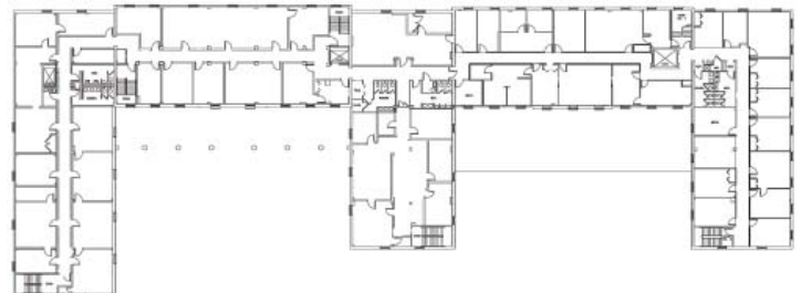
Typical Lee Building Layout

Approximately 15,000 square feet of office space will be available in our central, neoclassical styled Lee Building in June 2011. The Lee Building is five levels and is serviced by three elevators. The building is connected by covered walkway to a four level parking garage. The campus atmosphere is relaxed while offering a professional, functional and appealing environment.